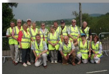
Olympic Torch Marshals