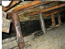
Visit to "Hopewell" Colliery