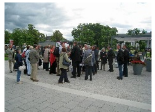
BUGA Westerwald 2011