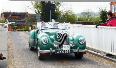
Wye Classic Car Run