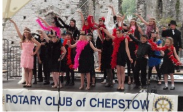
Grand Charity Concert