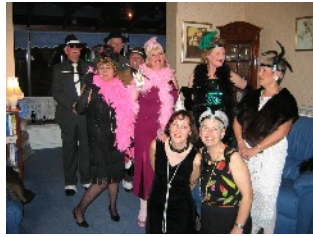
The Team "Mob" Conference 2005