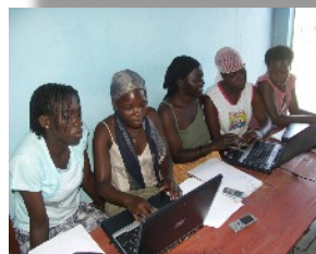
Computers for Uganda