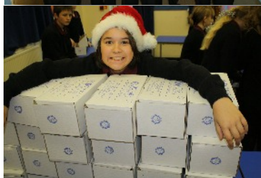
Rotary Shoebox Appeal