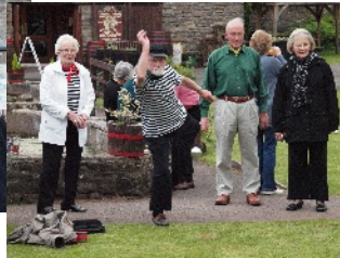
Boules evening -Abbey mill 2012