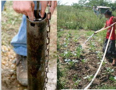
Romanian Well Project