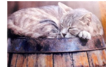
Young Photograph Competition