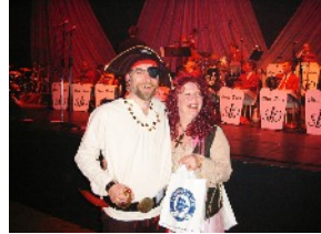
"Pirates" - Conference 2002