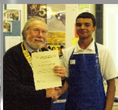
Young Chef Competition